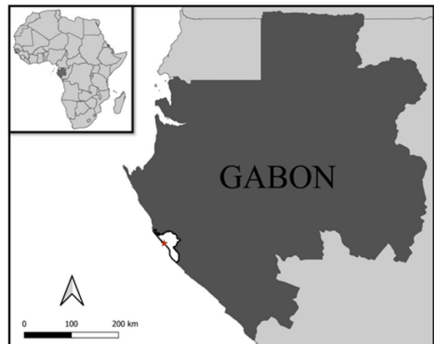
Fig. 1 Location of study site (red star) in Loango National Park (white), Gabon (dark gray). Maps were created using QGIS (v.3.10.5, QGIS Development Team, 2019), and shapefiles from the Map Library (Map Maker Ltd 2007) and Protected Planet (UNEP-WCMC and IUCN 2020)

The size of the Rekambo community ranged from 44 to 47 individuals during the study period, including 16–17 adult females and 8–9 adult males (see Table S2 in ESM).